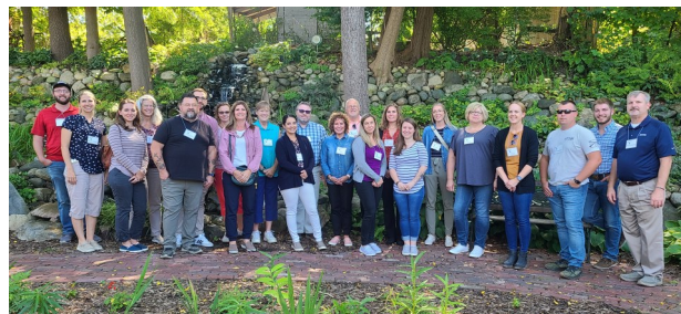
Leadership Montcalm XXIII Participants

Leadership Montcalm is a one-day-a-month training program that incorporates pertinent critical issues, education and skills training. This program has been designed by current local leaders to ensure the effectiveness of future leaders.